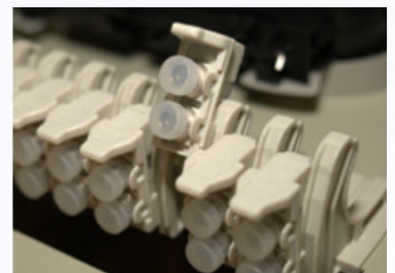
Sliding adapters for easy access

Specifications are subject to change without prior notice